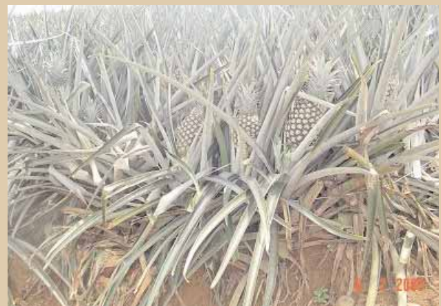
Good ratoon crop

materials is the slips. Slips are then removed by hand at once, selected in the field by size, grouped, collected, treated, transported to the field and planted. The process is repeated after the second crop. Where ratoon applying is practised, suckers are only removed after the second harvest and are selected, weighed and treated before planting. The minimum weight of a good slip or sucker for planting is around 8 ounces or 250 grams. The ideal weight of the planting material would be 15 to 16 ounces or 450g, i.e. 1 pound. Slips should be removed not more than two months after harvest.