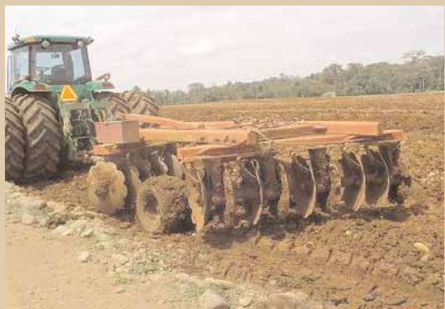
Harrow for land preparation