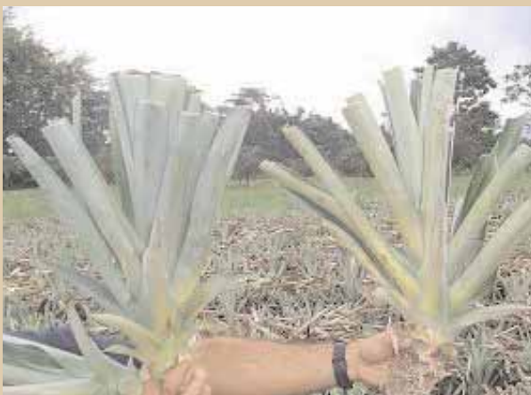
Large planting material