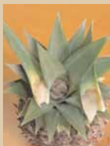
Phytophthora attack to the crown