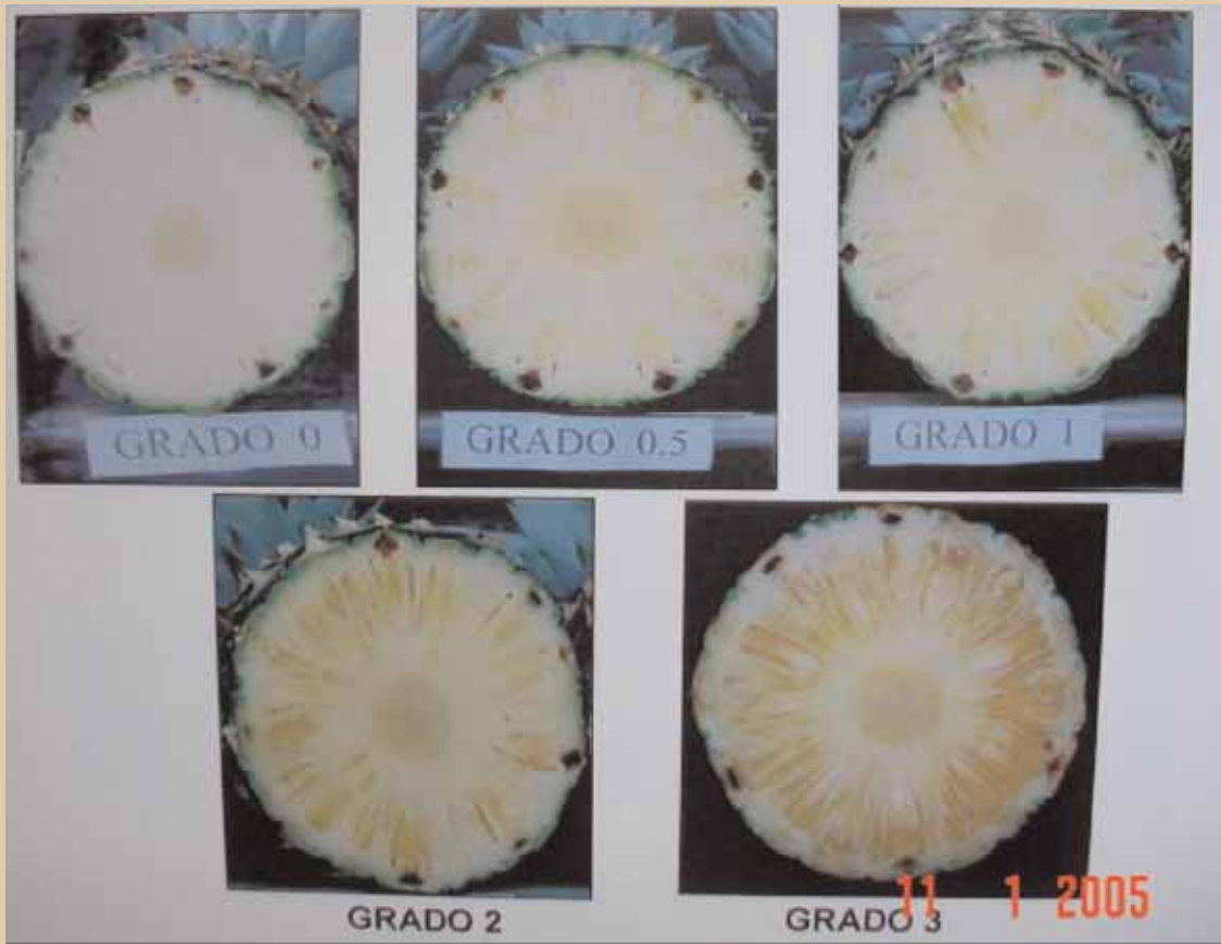
Translucence grades (see Page 39)