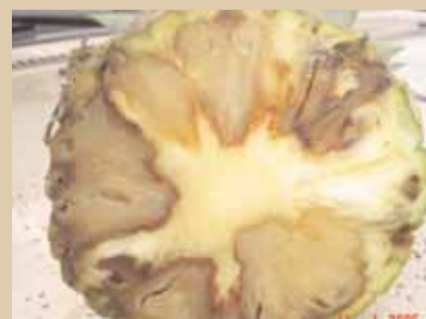
Phytophthora attack due to waterlogged condition

This fungus disease seriously attacks the MD2 variety. The P. Parasitica is more virulent and its symptoms are the rotting of the plant starting with the youngest leaves and then the older ones. Symptoms are rarely observed in the early stages of infection, but when the youngest leaf is pulled it comes out easily showing the rot at the base of the plant that produces the unpleasant odour. In advanced stages of infection the plant becomes yellowish and leaves turn reddish brown and start to die. The P. Cinamoni mostly affects the root system and may also cause heart rot. In all chapters there is a reference made to this disease that affects the crop throughout the crop cycle.