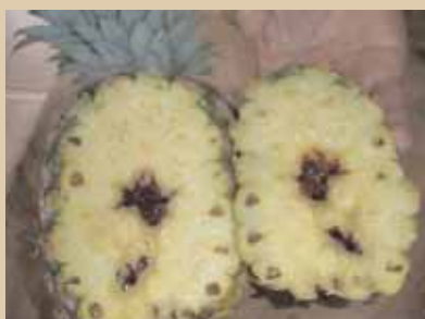
Thecla internal damage